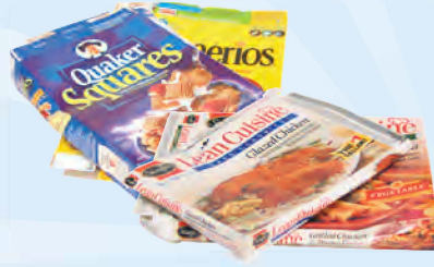
paper or frozen food boxes