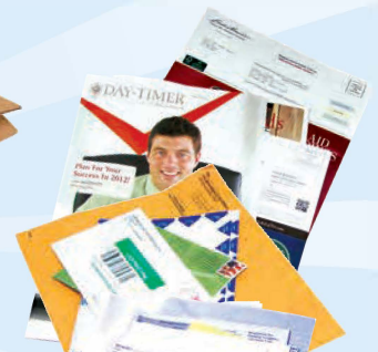
mail, magazines, mixed paper and catalogs