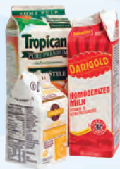
milk and juice cartons

PREPARATION clean · dry · quick rinse for milk and juice cartons